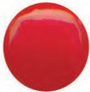
50 RED PASSION