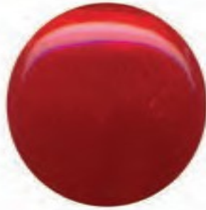
51 RED CARPET