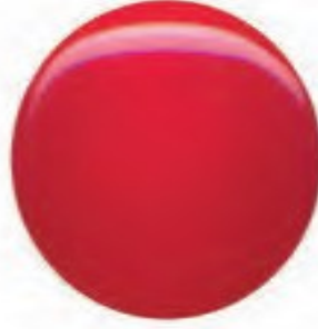
52 RED LIPS